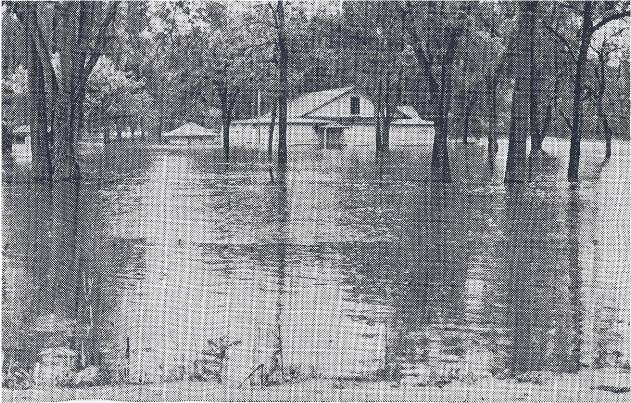
Sycamore Park Surrounded by Flood Waters

Sycamore Park was a privately owned park located near the current Sycamore Access to the Des Moines River on N.W. 66th Avenue. Early directions stated, "Sycamore Park is 7 miles N.W. of Des Moines, Go North on Merle Hay Road to Johnston Station, turn East."