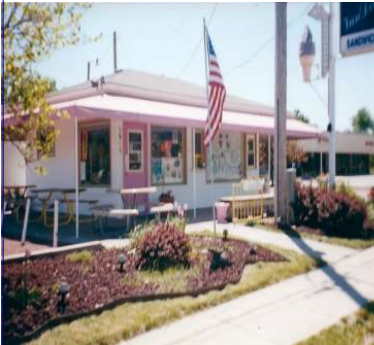
Van Dee's Ice Cream Shoppe