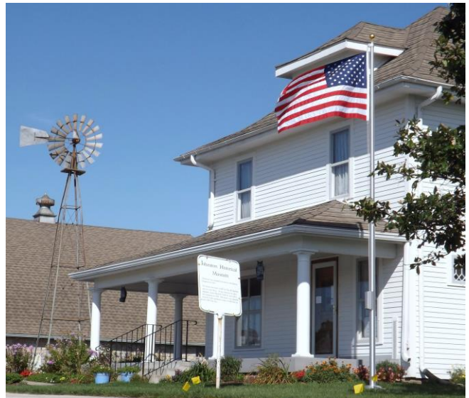
plate and taking on this task. You also secured the funds in which to make it happen. We know that it entailed coordination between the city of Johnston and the flag company to obtain a permit. It's a pleasure to work with you on the board and know that you are a "follow through" guy. The members of JHS thank you.