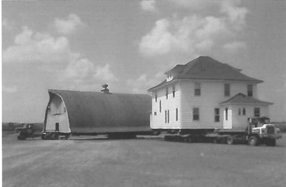
Mission accomplished! House and Barn on the site at Johnston Commons June 25, 2002