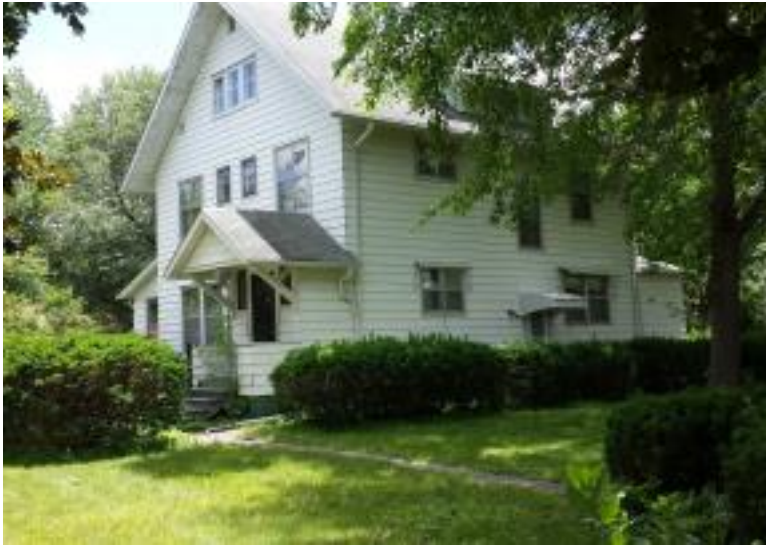
Stillwell House Picture taken in 2013