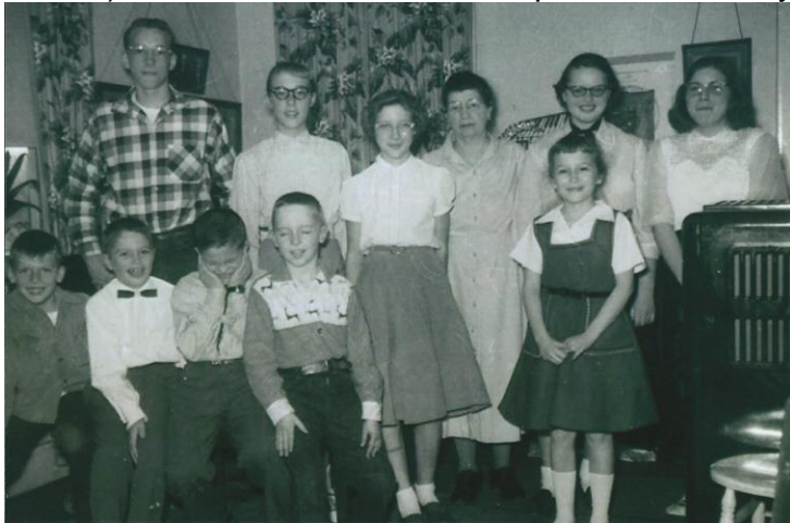
Music Club 1957