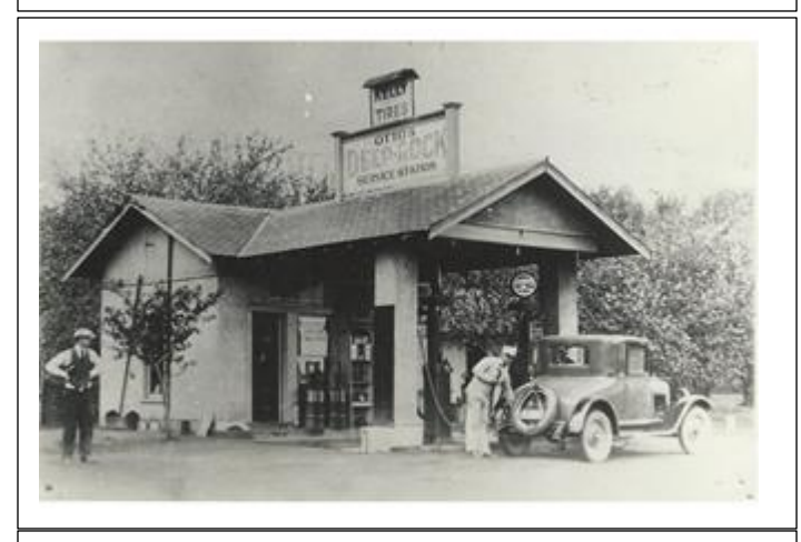
Otto's Deep Rock Service Station on opening day 1922