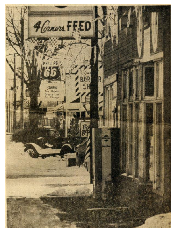
4 Corners Feed 1969