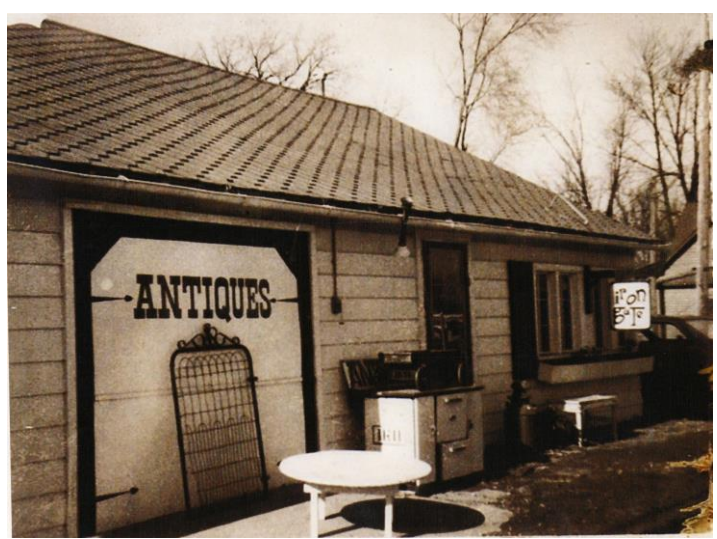
Marge Mable's shop, The Iron Gate. Located at the rear of the feed store facing NW 62<sup>nd</sup> Ave.