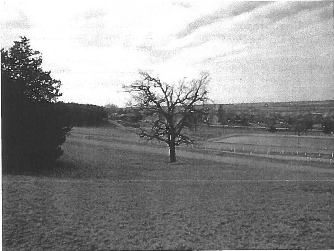
THE REMAINING "REAGAN OAK" OVERLOOKING CAMP DODGE POOL, CA 1999